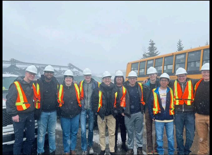
Min E 324 Drilling, Blasting and Explosives - Field Experience at Big Horn Mine (Hinton, AB)

The Mining Engineering Student Society strives to maintain an enthusiastic connection to industry, not only to support our students - but to support the future of industry. We host multiple events every year to further support and build the bonds between businesses and students. These events include, but are not limited to an industry night to educate and raise awareness to first year students, Industry information hosted night where specific employers are invited to campus and have an information session about their company.