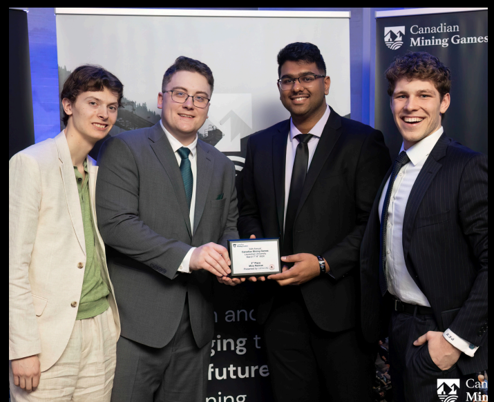
Silver Medal in Mine Rescue event at Canadian Mining Games 2024.