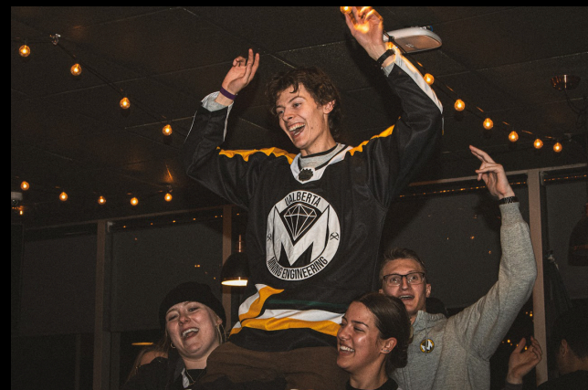
Geer Week Opening Ceremony

Our most anticipated event on campus is Geer Week, which is a multi-disciplinary competition held at the UofA. Many challenges include being quick on your feet and showing off your engineering talent. These challenges include filming an editing a movie, forming a band and playing in front of your colleagues and debate' where the goal is to debate a random topic chosen at the scene with no prior preparation.