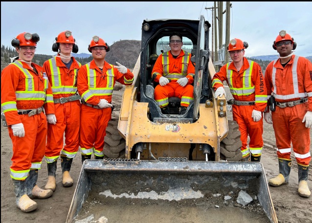
Hands-on preparation for Canadian Mining Games at New Afton Mine

Our competitive teams take immense pride in providing a wide variety of hands-on training experiences that prepare our participants to excel in every challenge. With the support of our sponsors, we are able to offer invaluable opportunities such as training sessions at active mining operations like New Afton's underground mine, as well as collaborating with competitive mine rescue teams to equip them to thrive in competition.