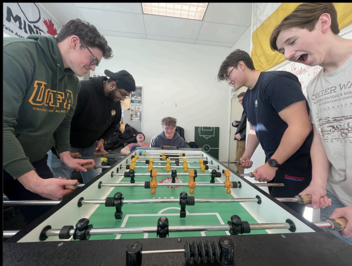
Bi-annual Foosball Competition