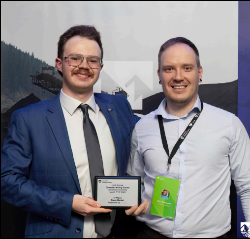
3rd Place in Goodman Gold Stock Market Challenge

The 2024 Goodman Gold Challenge is a prestigious mining investment competition where undergraduate students assess the investment potential of three gold companies listed on the TSX or TSX-V. Participants will recommend one company to a panel of top-tier clients, testing their academic knowledge and presentation skills in a real-world setting. Students will also have the opportunity to interview CEOs from the companies, gaining insights into their financial outlook. The University of Alberta is proud to take home third place in last years challenge held in Sudbury, ON.