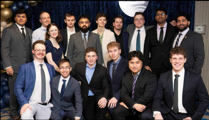
2024 Canadian Mining Games University of Alberta Team

The Canadian Mining Games (CMG) is the most highly anticipated Canadian mining intercollegiate event, awaited by both engineering students and industry sponsors alike. Of the last 7 CMG's the University of Alberta has proudly podiumed at 6 of these competitions, three of which were back to back wins. The exposure at these events is massive; over 176 students from competing universities compete as well as multiple representatives from over 23 company sponsors.