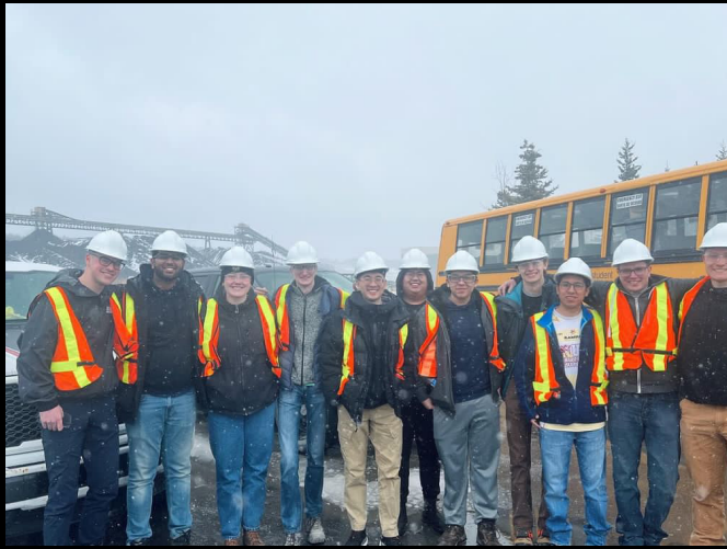
Min E 324 Drilling, Blasting and Explosives -Field Experience at Vista Mine (Hinton, AB)

The Mining Engineering Student Society strives to maintain an enthusiastic connection to industry, not only to support our students - but to support the future of industry. We host multiple events every year to further develop and deepen the connections between businesses and students. We host a variety of events to that effect, including not only technical guest lectures from our sponsors (allowing them to present valuable, real-world, knowledge), but industry information nights, and experiential learning opportunities with our sponsors.