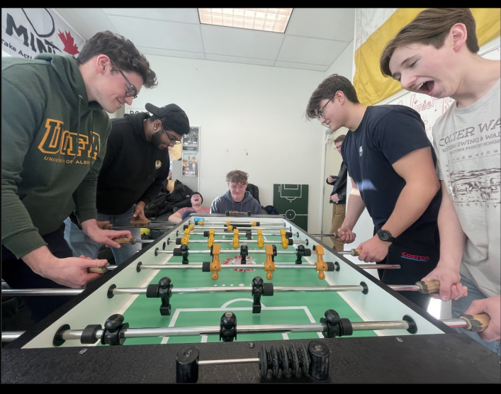
Bi-annual Foosball Competition