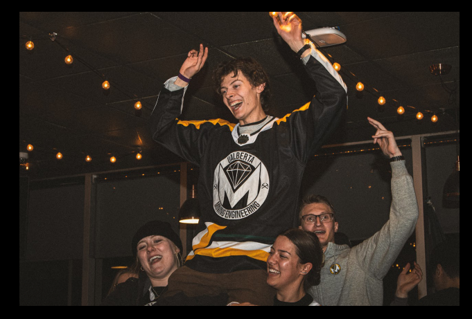
Geer Week Opening Ceremony

Our most anticipated event on campus is Geer Week, a faculty of engineering competition, amongst the different disciplines at the University of Alberta. Many challenges include being quick on your feet and showing off your engineering skills. These events have included filming and editing a movie, battle of the bands, trivia, and debate, amongst others. This series of events bring together our community and are an memorable part of being in our organization.