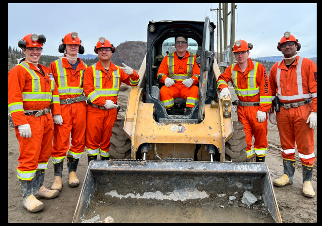
Hands-on preparation for Canadian Mining Games at New Afton Mine

Our competitive teams take immense pride in providing a wide variety of hands-on training experiences that prepare our participants to excel in every challenge. With the support of our sponsors, we are able to offer invaluable opportunities such as training sessions at active mining operations like New Afton's underground mine, as well as collaborating with competitive mine rescue teams to equip them to thrive in competition.