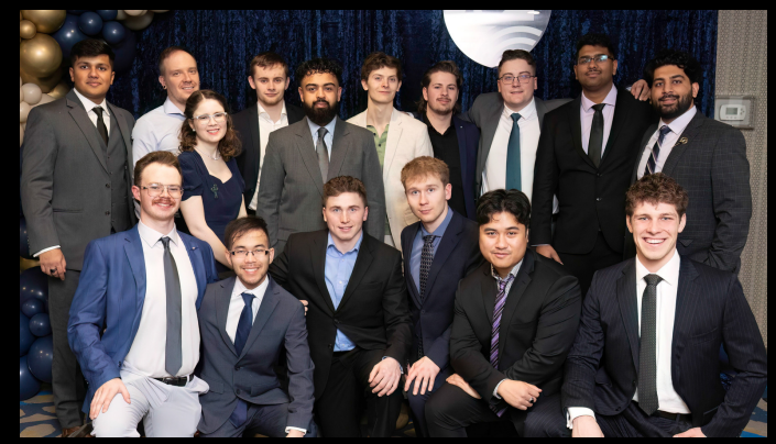
2024 Canadian Mining Games University of Alberta Team

The Canadian Mining Games (CMG) is the most highly anticipated Canadian mining intercollegiate event, awaited by both engineering students and industry sponsors alike. Of the last 7 CMG's the University of Alberta has proudly podiumed at 6 of these competitions, three of which were back to back to back wins. The exposure at these events is massive; over 176 students from competing universities compete as well as multiple representatives from over 23 company sponsors.