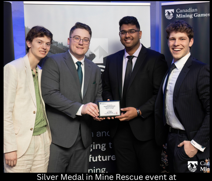
lver Medal in Mine Rescue event at Canadian Mining Games 2024.