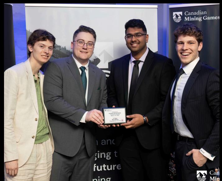
Silver Medal in Mine Rescue event at Canadian Mining Games 2024.