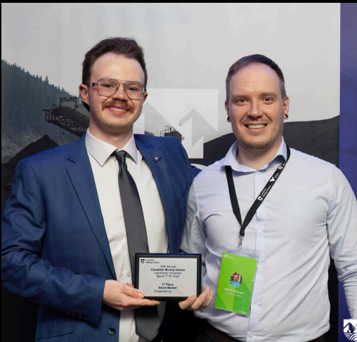
3rd Place in the Stock Market Challenge, at CMG 2024

The Goodman Gold Challenge is an investment competition where select teams assess investment potential of three real mining companies. Acting as a top-tier financial firm, teams review pitches and investment potential to choose one company to support. Testing their knowledge and analytical skills, participants justify their choice to a panel of esteemed judges, and a winner is chosen. Students will also have the opportunity to network with industry, gaining insight and connections. The University of Alberta is proud to announce that a 2025 goal is competing in this prestigious event.