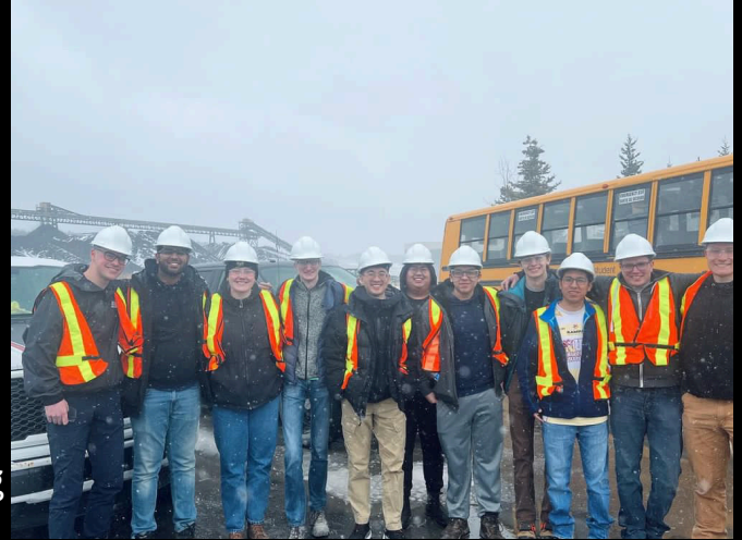
Min E 324 Drilling, Blasting and Explosives - Field Experience at Vista Mine (Hinton, AB)

The Mining Engineering Student Society strives to maintain an enthusiastic connection to industry, not only to support our students - but to support the future of industry. We host multiple events every year to further develop and deepen the connections between businesses and students. We host a variety of events to that effect, including not only technical guest lectures from our sponsors (allowing them to present valuable, real-world, knowledge), but industry information nights, and experiential learning opportunities with our sponsors.