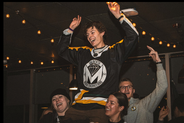
Geer Week Opening Ceremony

Our most anticipated event on campus is Geer Week, a faculty of engineering competition, amongst the different disciplines at the University of Alberta. Many challenges include being quick on your feet and showing off your engineering skills. These events have included filming and editing a movie, battle of the bands, trivia, and debate, amongst others. This series of events bring together our community and are an memorable part of being in our organization.